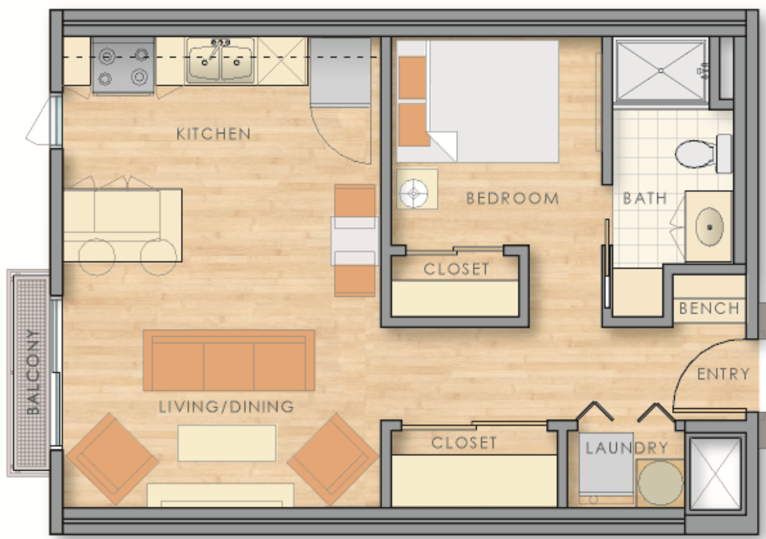
TYPICAL UNIT PLAN 572 SF SCALE: 1/8"=1'-0"